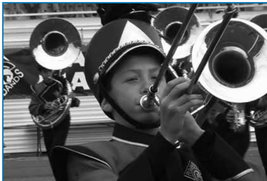
Park Hill School District hosted its first Marching Band Festival, where 20 bands competed and performed.